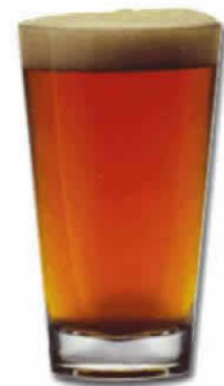
The BeerBlast™ for the perfect mix!

The BeerBlast™ provides the exact gas mix required, protecting the kegged product quality, eliminating over foaming or under carbonation, increasing yields/profits, and ultimately satisfying the customer, which increases loyalty. South-Tek’s line of BeerBlast™ systems creates its own 99.8% pure N 2 from the air and in turn blends it with the correct ratio of CO 2 thus reducing your operations efforts and costs, while maintaining product quality.