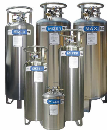
Carbo-Series Bulk CO 2 Systems